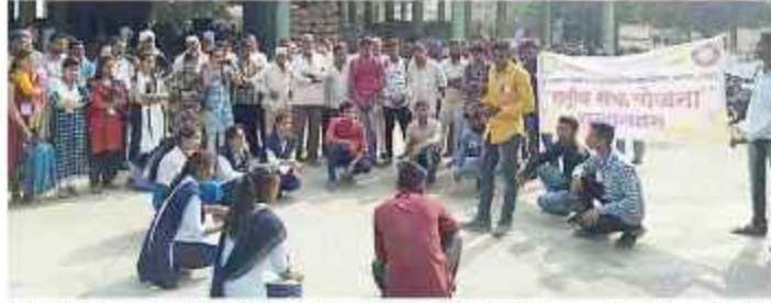
कारंजा : पथनाटय सादर करताना गोयनका महाविद्यालयातील रासेयो स्वयंसेवक.

अग्रामी विधानसभा निवडणुकीच्या पृष्ठभूमीवर अधिकधिक मतदारांनी आपला मतदानाचा अधिकार वज्रवाच, यासाठी निवडणुक आयोगाकडून विविध उपक्रम राबविण्यात येत आहे. शासन देखील या कामात पुढाकार घेत आहे. विद्यार्थ्यांनी देखील यासाठी पुढाकार घेतला आहे. कि. न. गोयनका