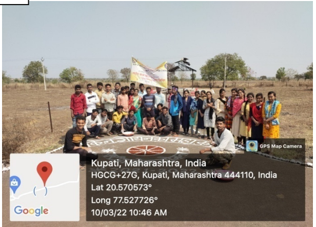
Special Camp Activity