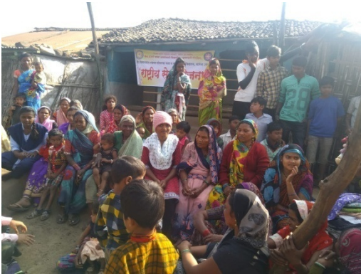
Visit to Adivasi Family